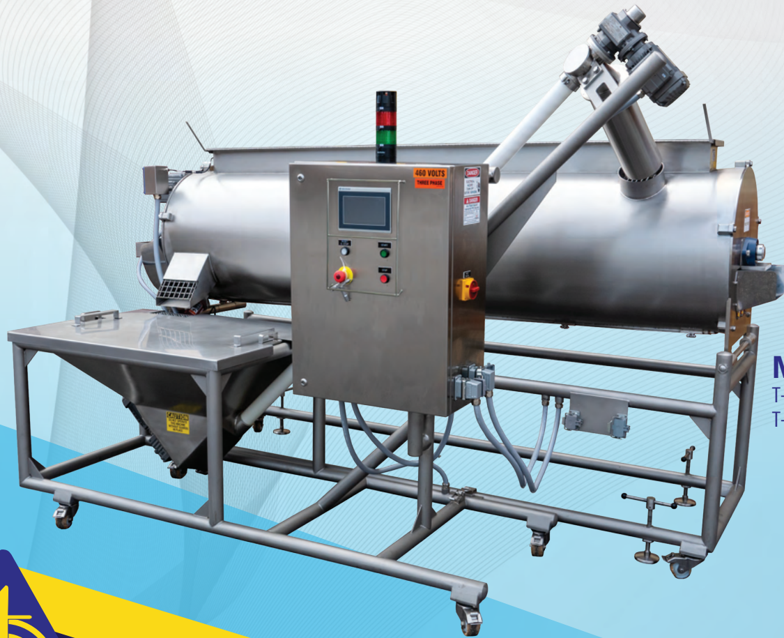
Models T-1000 T-2000